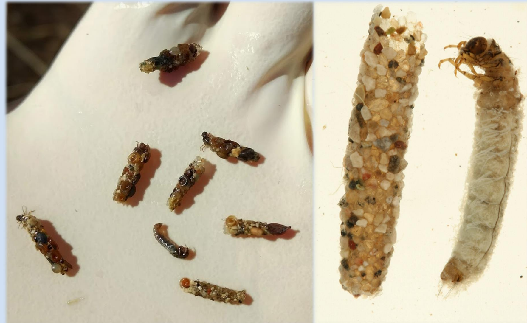
Figure 1: Philarctus bergrothi with their typical mineral-based case