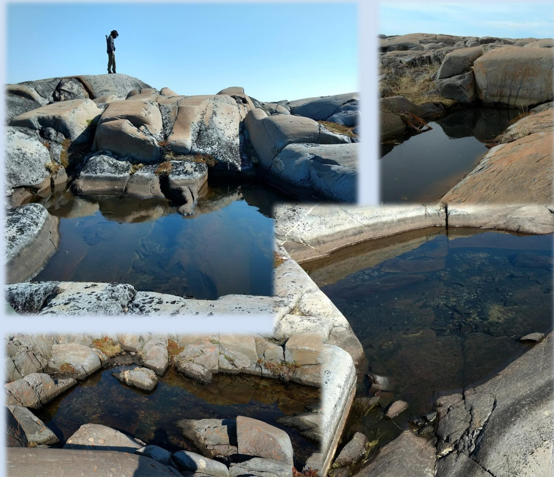
Figure 2: Examples of bluff ponds that were sampled in Churchill.