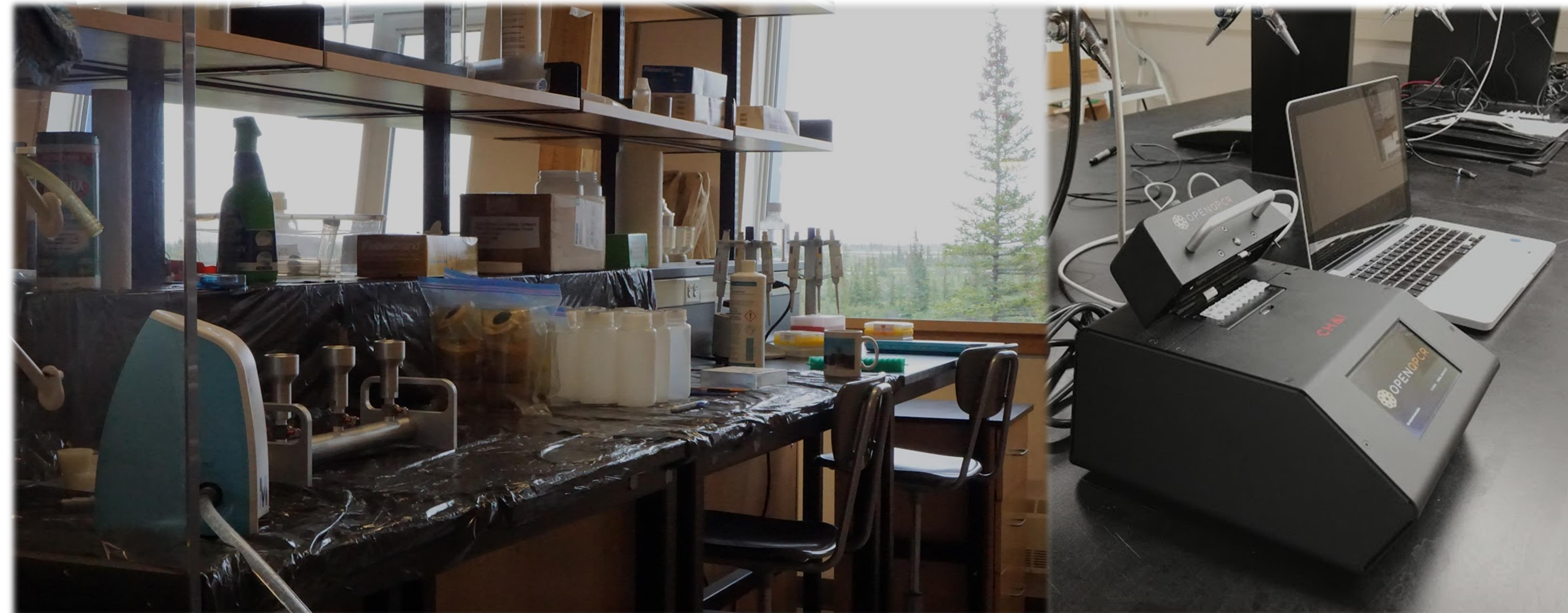
Figure 3: A picture of the laboratory setup that allowed us to obtain qPCR results in the field. To the left is the pump and manifold where the water samples were filtered, then a space where extractions were performed using the Biomeme extraction kit, our minimal PCR reaction setup station and finally the Open qPCR, a 16 well qPCR machine that is very portable.